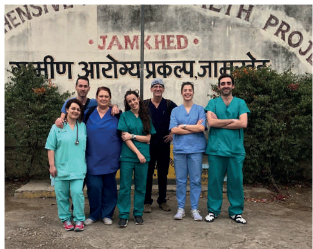
surgical medical team GICAM's

to ship to Los Quinchos, a charitable association that provides housing for abandoned and mistreated children in Nicaragua. Another important project was the sponsorship of the logistics of the surgical medical team GICAM's (International Group of Friends of the Hand Surgery) third mission, by shipping a container loaded with hospital equipment to Jamkhed, Maharashtra in India.