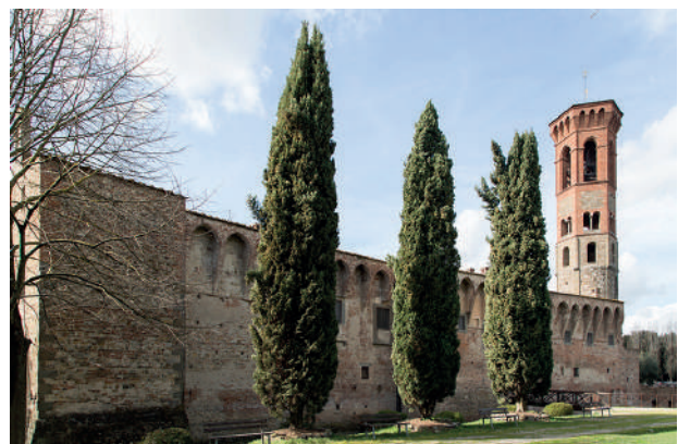
San Salvatore and San Lorenzo Abbey

Savino Del Bene encourages cultural initiatives and supports associations such as SOSTRATOS, a Purpose Trust founded to promote culture as well as to create work and wealth through the development of its research projects (e.g. archaeological excavations), and the San Zanobi Association,